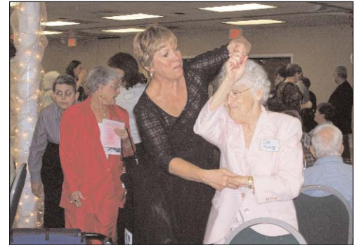
Johnson Ferry hosts the Magnolia Ball each year for over 300 nursing home and assisted living residents.

The church’s gymnasium is transformed into a 1940s big band dance hall with hundreds of lights, finger foods, and a 40-piece jazz ensemble. “We want to help these elders remember that they are loved and cared about and that they have not been forgotten.”