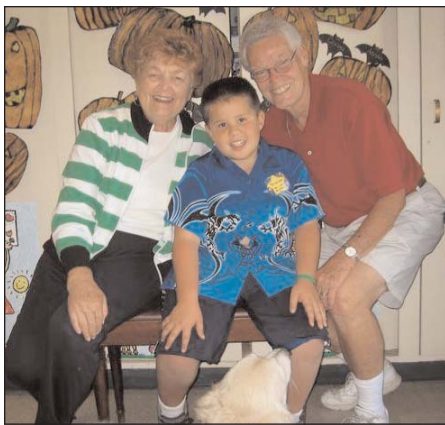
The aging sensitivity curriculum at First Evangelical allows children the opportunity to interact with a different generation.

Children learn through interactive games and activities some of the changes in vision, hearing and balance that occur with age and are trained in how to be more compassionate and respectful around those who are older. They also are taught a scriptural view of aging through verses like Psalms 92:14 and character studies, such as the life of Moses. Rosalyn, writer and teacher of the curriculum, shares "Part of the program is to bring in seniors who have had an active youth life, like those who have fought in the war and can show the kids their medals. Some of these children do not see their grandparents and therefore do not have the opportunity to interact with a different generation. All they know about aging is what they see through the media. We want to show them another viewpoint." An important part of the curriculum is to encourage young people to think about how God can use them now to minister to older adults. Towards the end of the lessons, the children visit elders in assisted living facilities and nursing homes. Rosalyn has taken