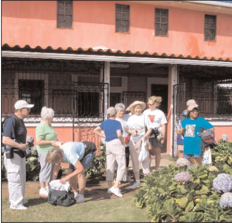
With a name like Encore, several “new-olds” began to join the ministry at First Evangelical.

leadership team liked the name Encore because it means, “great job; do it again.” The next phase in the reorganization of their ministry is to simply provide opportunities for the “new-olds” to interact with those that have been participating for a long time.