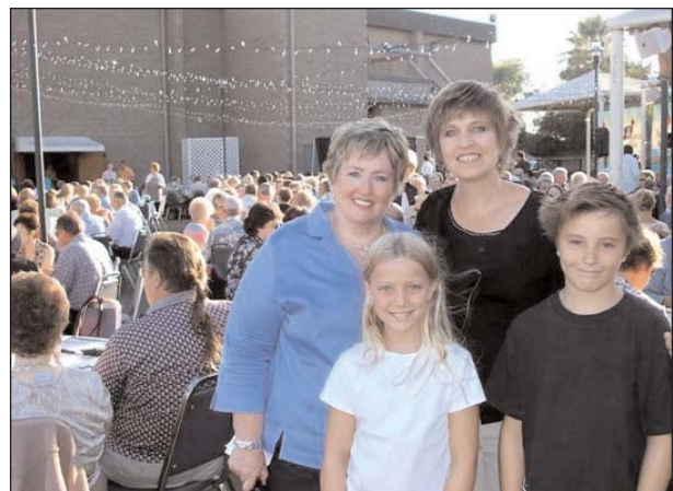
A group of helpers pose at a monthly Sunday school event called Moonlight Strings.

Another effective way of combating the negative views of aging is through education. First Evangelical Free has embraced the importance of this and has developed an aging sensitivity curriculum that they share with young people. The curriculum has been taught through the