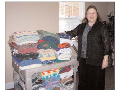
The Magnolia Ball guests are each given a blanket to help them remember that they are being prayed for.