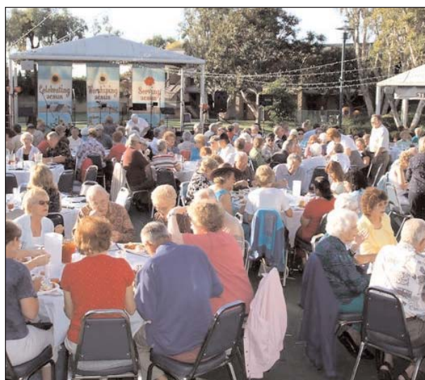
The senior adults ministry at First Evangelical Free Church hosted "Moonlight Strings" in the church plaza, and had over 500 people in attendance.

The following pages will tell the stories of churches that have a heart for older adults and a passion to see them flourish in God's Kingdom. "Open your eyes and look at the fields! They are ripe for harvest." (John 4:35).