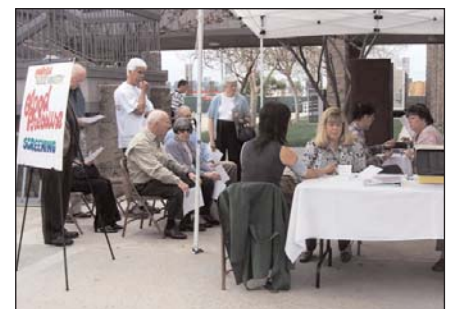
Monthly blood pressure clinics are a part of the Parish Nurse program offered by First Evangelical Free Church.

Another ministry that has been growing throughout churches of all sizes and denominations is the parish nurse program. Also called health ministry, this modern movement originated in 1980 under the leadership of Granger E. Westerberg. Parish nurses are currently licensed registered nurses who obtain additional training to help them in developing health and caring ministries in churches. While the traditional parish nurse program serves all ages of the church body, many older adult ministries have found it to be an effective way of meeting needs among the seniors. Chronic illnesses and medical problems become more common as people