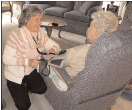
A parish nurse in the First Evangelical Free program makes a home visit.

There are 11 volunteer parish nurses under the direction of one full-time nurse who is a church staff member at First Evangelical Free Church in