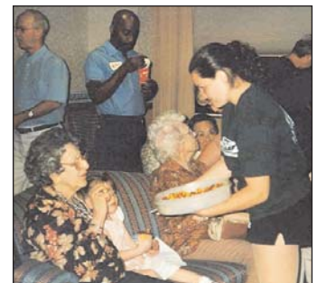
Some churches are tapping into the benefits of integrating adult ministry with other age groups.

Conventional wisdom used to be that people in church should be grouped according to age. The thinking was that teens should hang out with teens, young parents with other parents and senior adults with seniors. Even neighborhoods are set up in this fashion, with young people attending school, the middle-aged adults working and raising families and the older adults living out their years with others in retirement. While this system of grouping people may be educationally and economically sound, it does not take into account the powerful impact of human connection and the desire of older adults to make a difference with their lives.